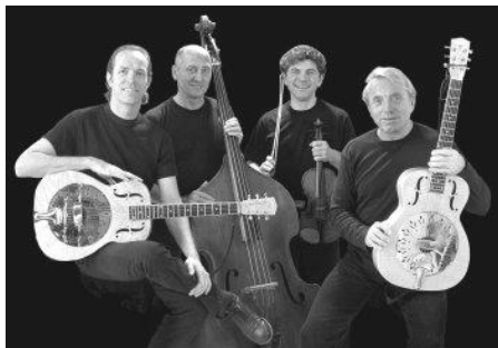
'OPUS 4' are coming to Tattingsstone

We hope many of you will join us. Lyn Tomlinson 01473 328251