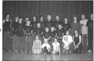
Karate Class wearing their summer camp t-shirts